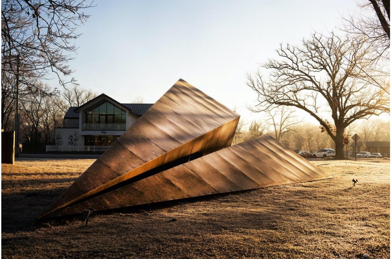
Launch Intention, a project by Griffin Loop presented by Fabrik Projects, Los Angeles.